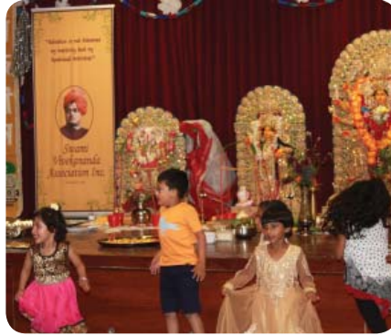
New generation of SVAI