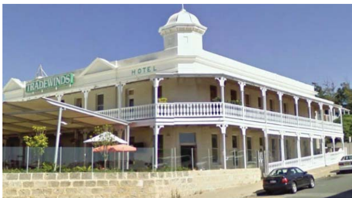
The Tradewinds Hotel in East Fremantle, which used to be called the Plympton Hotel.