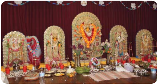
Durga puja celebration by SVAI