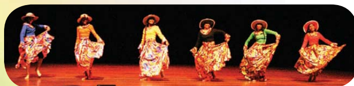
Academy of Sri Lankan Dance, Drama and Music - Sri Lanka