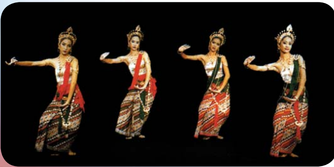
Thai Srivichai Dance - Thailand