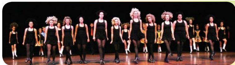
WA Academy of Irish Dancing - Ireland