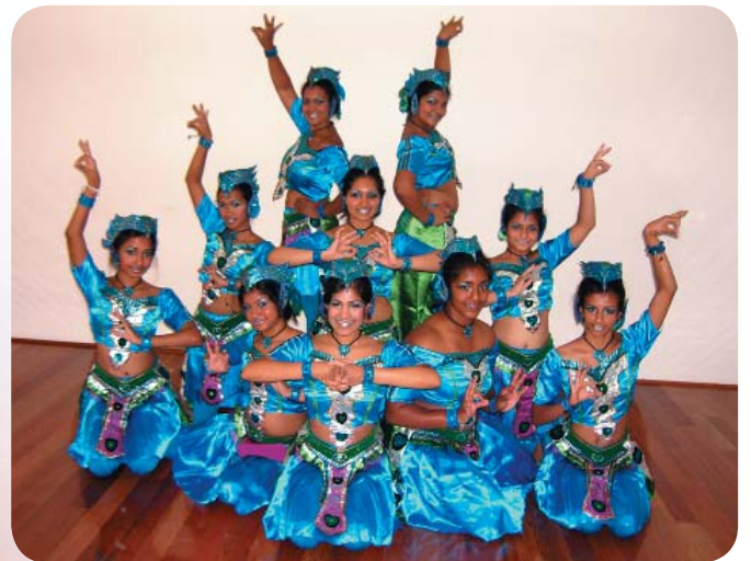
Pavithra Dance Troupe - Sri Lanka