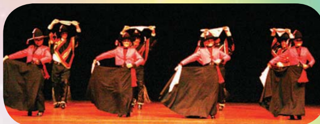
Fantasia Latina - Chile