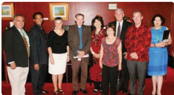
Committee Members and Guests