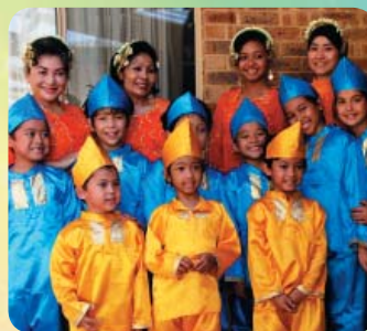
Peacock Dance Group - Indonesia