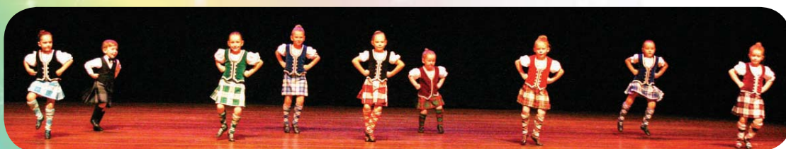
Highland Dance Academy - Scotland