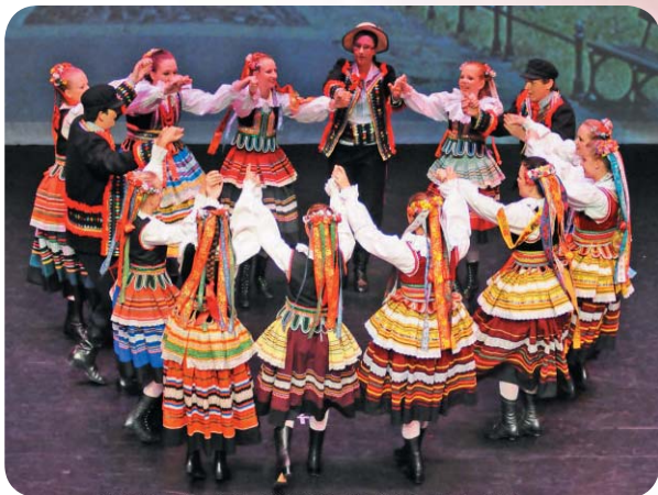
Polish Dance Group Kukuleczka Inc. - Poland