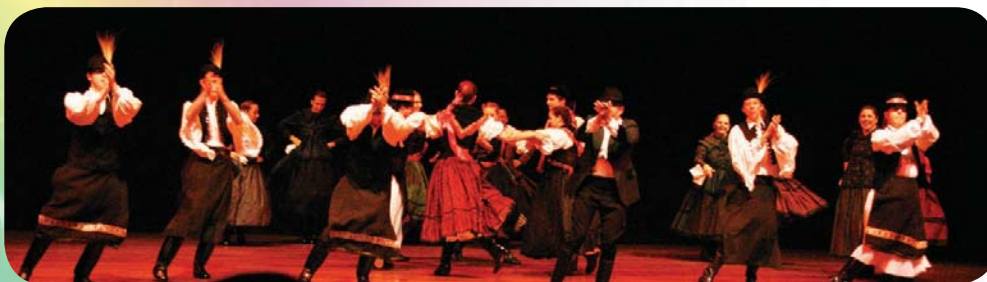
Keszkeno - Hungary