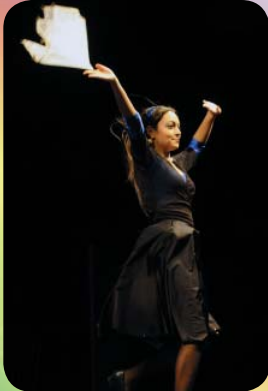
St. Andrew's Greek Dance Group - Greece