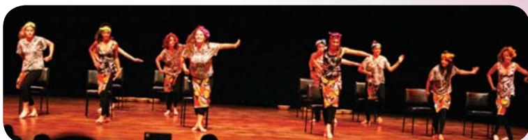
Duncraig Senior High School "Afrotonikettes" - Senegal