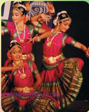
Kalaivani School of Indian Classical Arts - India