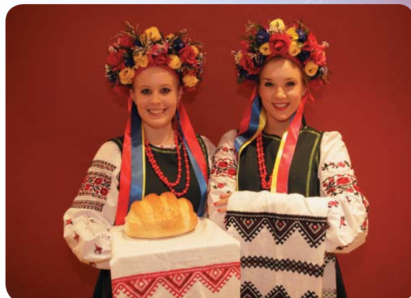
Roztiazhka Ukrainian Cossack Dancers - Ukraine