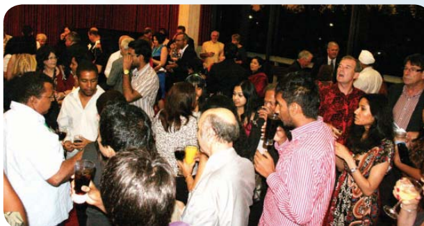
VIP Guests